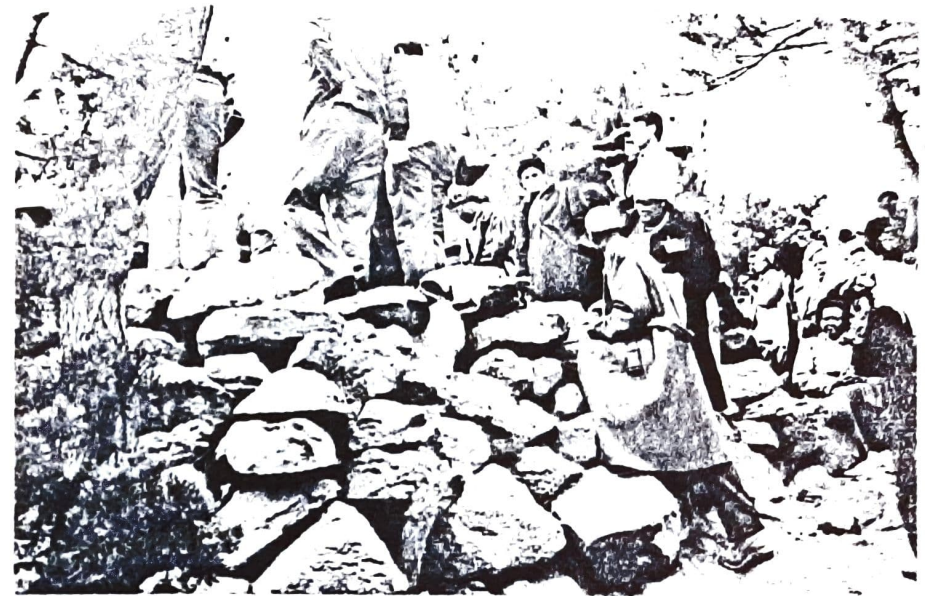
1988 conference at the "Rock of Tears" near Pusan, Korea, where Moon supposedly received revelations and visions of Jesus

follow the revelation of Jesus over that of unnamed false teachers. Besides this, Mr. Moon's teaching on the Holy Spirit makes mockery of the Trinity. His concept of the Holy Spirit is that the Holy Spirit is only temporarily the Second Eve, soon to be replaced by Mrs. Moon, the Third Eve. 35 Mr. Moon's lack of Biblical knowledge surfaces again, for Jesus told us that the Holy Spirit will abide with us forever (Jn. 14:16). Forever is eternal, not to be replaced with a new person.