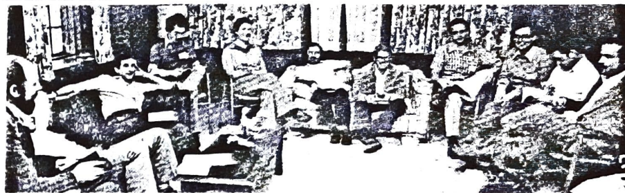
Dialogues in 1979 at the Unification Theological Seminary

Unification Theological Seminary students at their Barrytown campus in New York. At this conference there were several other ministers, some who were mildly listening to anything expounded upon by the Moonies, while others were quick to challenge issues of false doctrine with the Bible. I was particularly interested in why the Moonies spent the money to get us there, what was their purpose? A couple of the students told me of plans to send U. C. members into the established Christian Churches and begin to teach their doctrines. They showed me the plan given by Moon a year earlier. Moon said, "Did you know that the Barrytown students are visiting 120 different churches in the area? You will do the same thing; first you will visit people in their homes and then go to their churches and explain to the congregations what we are." 18